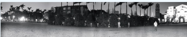
Night View (IR On)