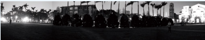
Night View (IR Off)